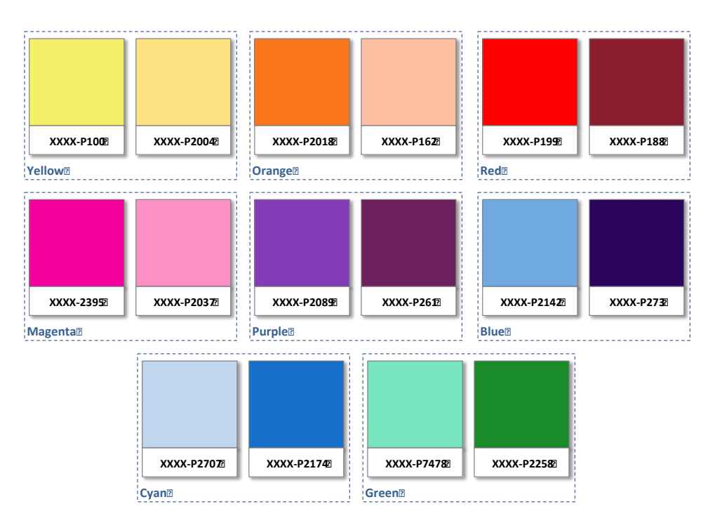
Figure 1: Pantone Standards Selected for Testing

Using well-controlled ink formulation, printing, and measurement processes, this test seeks to validate the overall method used to produce dependent libraries on a representative set of colors. This philosophy is similar to the standard print tests used in the industry today, from G7 through to ICC Profiling, where exhaustive validation is neither feasible nor desirable.