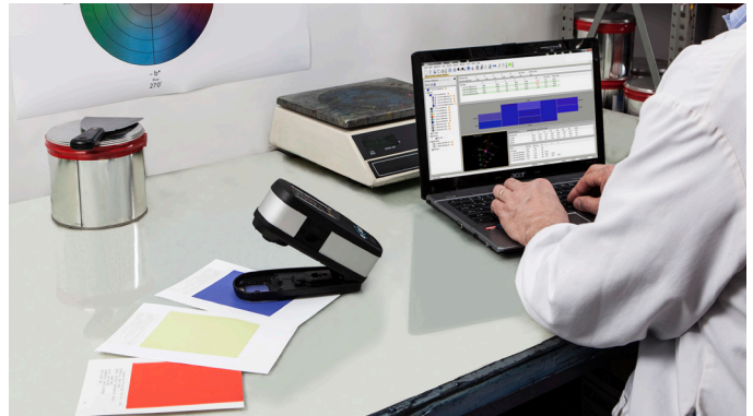
Statistical analysis to keep your business on track

Color iQC Print provides multiple methods for users to select and format color data, directing it to a location or application of choice within the color network. This ability for color systems to share data across time and geography is becoming increasingly important in a fast-paced and highly connected working environment. An easy-to-use application program interface (API) allows direct connectivity to software functionality.