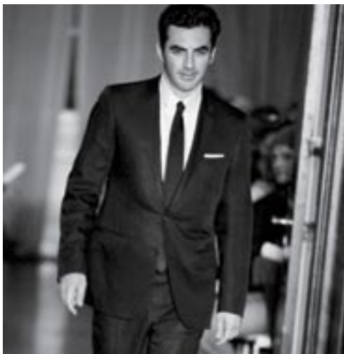
YIGAL AZROUEL prominent colors eggplant, mulberry, lilac, cobalt blue, midnight blue, ochre, army green, black, pearl and white inspiration gauguin signature color eggplant, shades of purple color philosophy expect the unexpected: mustard and midnight, olive and navy, cobalt and pearl.